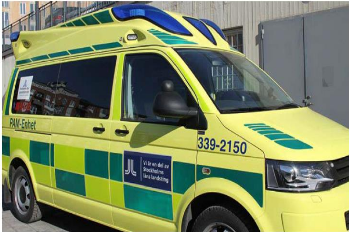
Figure 1. Psychiatric Emergency Response Team (PAM) vehicle (exterior).